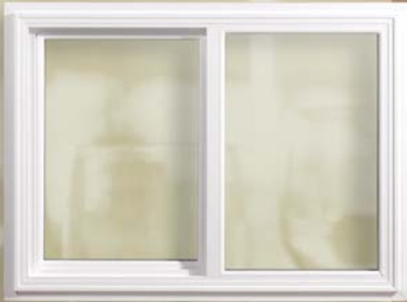
Horizontal Slider Outside