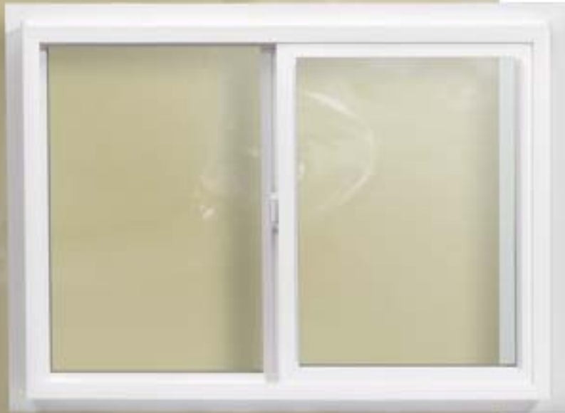
Horizontal Slider Inside